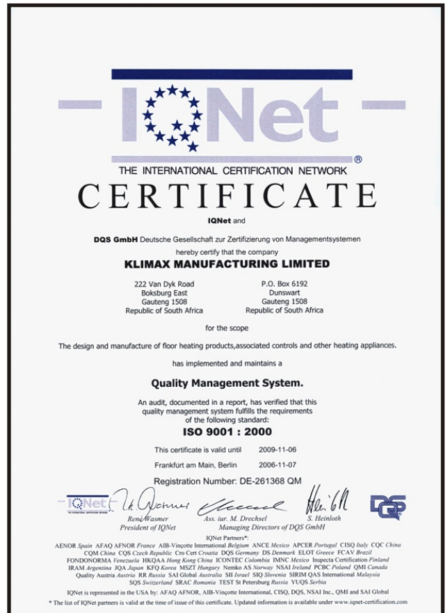
Klimax IQNet Certification