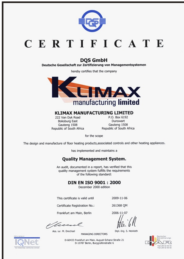
Klimax DQS Certification